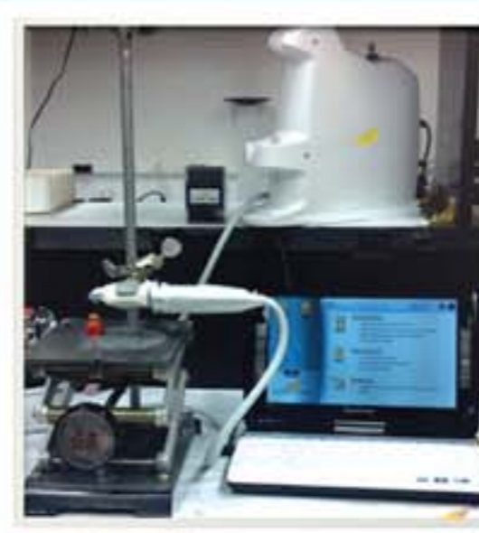
Fig 1: The experiment apparatus

Following sterilization of the teeth with ethylene oxide, the teeth were incubated in 2 Liters of Colombian coffee for 72 hours at room temperature. The teeth were air-dried for 10 seconds with an air-syringe to eliminate moisture in the lesion pores, and then scanned.