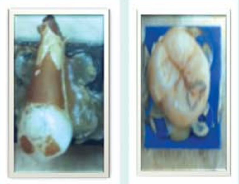
Fig 2: Bacteria plaque. Smooth surface lesions mounted horizontally and occlusal surface lesions mounted vertically